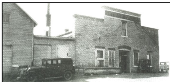
The Sevmour Creamery on Elizabeth St.