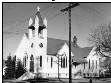
The Methodist Church

school buildings are now located along Highway 54. The movie theater was a popular spot, not just for movies, but for traveling shows.