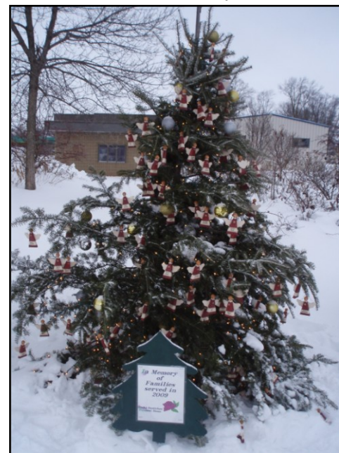
The Muehl-Boettcher tree is in memory of those who passed away this year.

The Museum's "Memory Forest" has made Depot Street the