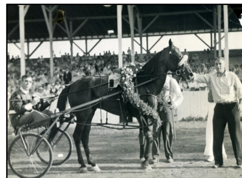
Horseracing was a big attraction at the fair.

My parents never had a car, so we didn't travel much. In fact, we only went to Appleton once or twice a year. Fair week was a big deal. Kids loved the rides and games. My favorite was the surrey races. Horse racers from all over the state came to