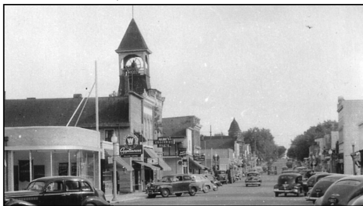
The city hall bell tower dominated downtown.